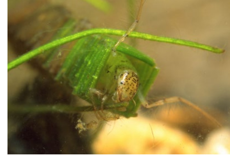
The log cabin caddis fashions an intricate home from neatly cut lengths of water plant leaf.

You can download The Waterbug App for free from Google Play or the App Store. It'll teach you the names of all the waterbugs, and when it gets upgraded in September it will help you tell how healthy your river is too!