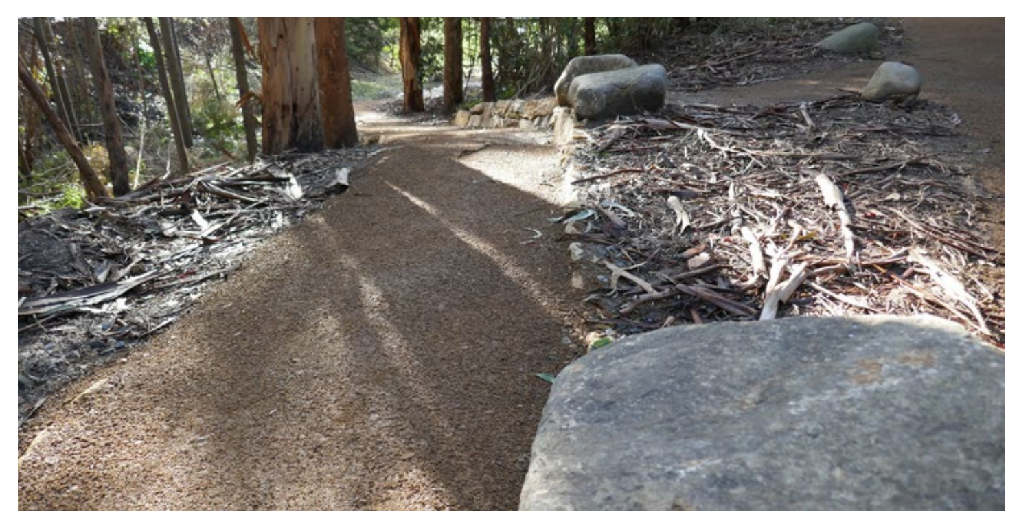
Completion of the new walking track at Salvator Rosa Glen Creek.