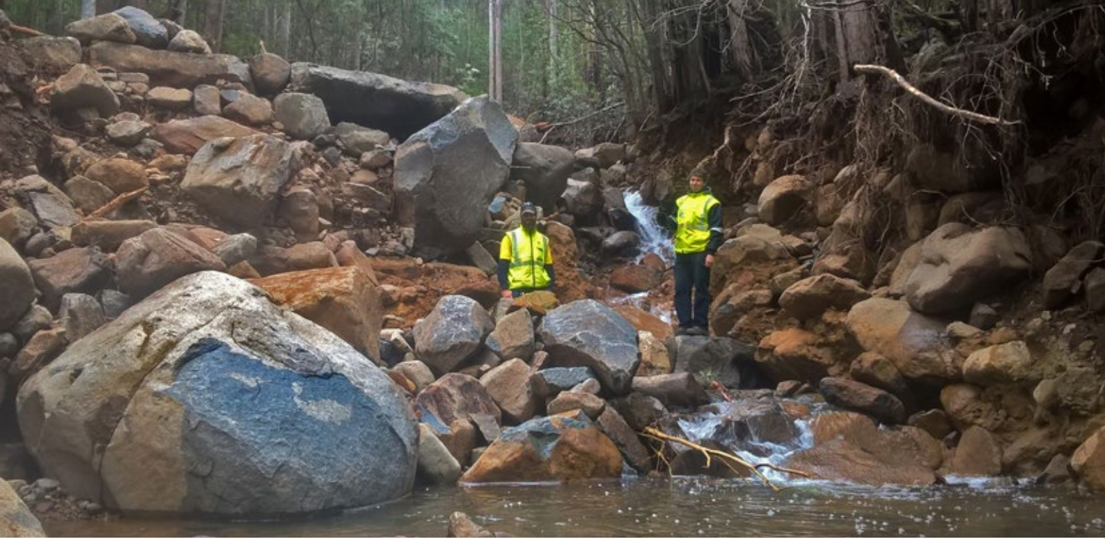
North-South Track – staff assessing damage at the Clapper bridge.