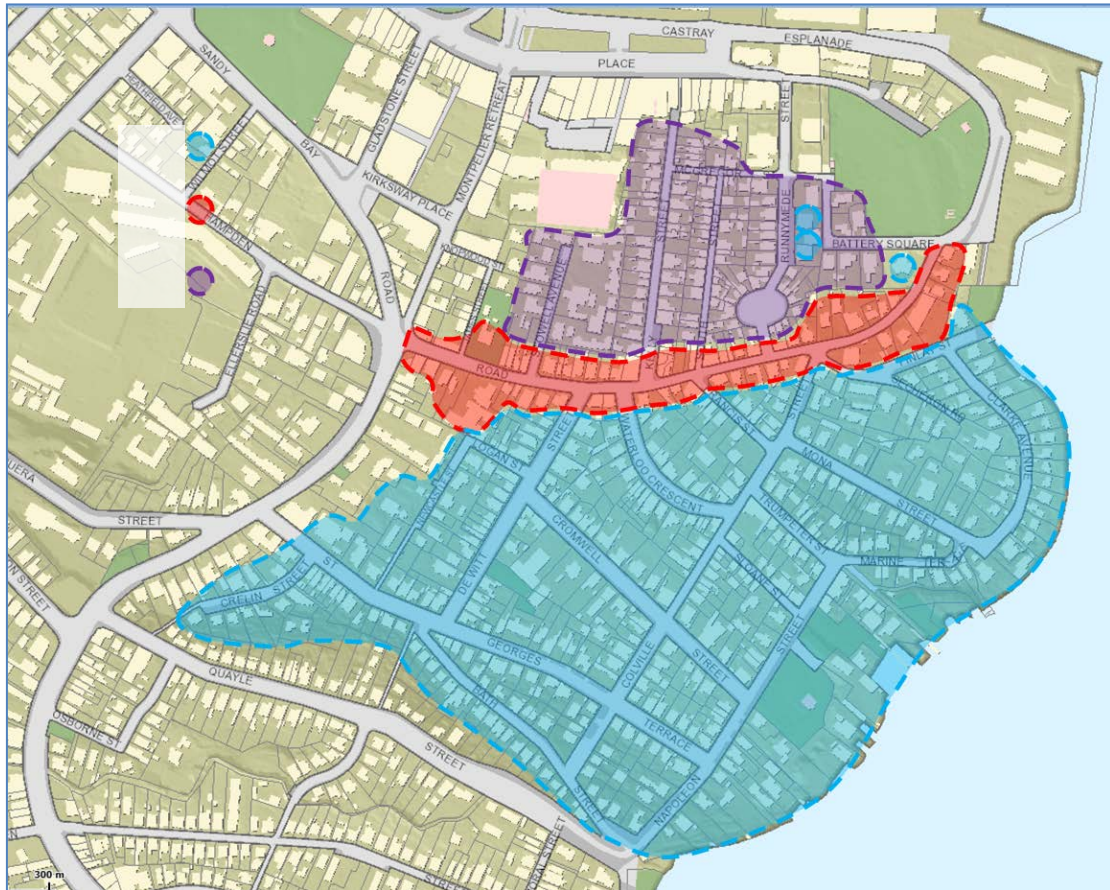
Figure 1 – Battery Point Resident Parking Areas from 2014 Review

In summary, in 2014, in the part of Battery Point as shown in Figure 1, there were 443 annual resident parking permits issued. In this same area there were 802 on-street parking spaces, with 482 of those 802 on street parking spaces having restrictions providing priority to resident parking permit holders.