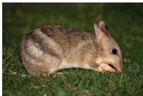
New habitat logs will create shelter for eastern barred bandicoots and other wildlife.

section of the Queens Domain will replace valuable ground habitat lost through years of development, bushfires and even wood hooking, which is now illegal.” Up to 40 large logs will be installed on the Domain by the City of Hobart’s fire and biodiversity staff, who have used chainsaws to cut hollows and grooves into the fallen timber to create habitat for birds, micro bats and other wildlife. Sustainability in Infrastructure Portfolio Committee Chair Councillor Bill Harvey said the bounce back in native wildlife on the Queens Domain over the past five years had been extraordinary.