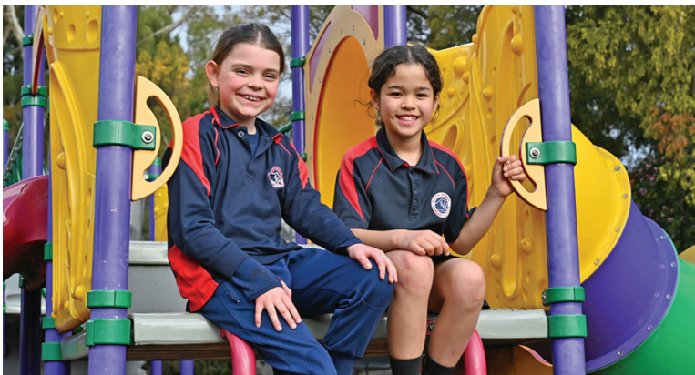
Harper and Nai love visiting the playground after school.

THE City of Hobart has released a draft master plan for South Hobart Oval and Park following extensive community consultation. The final plan will guide upgrades to the oval, basketball and tennis courts, park and play areas while ensuring cultural, environmental and social values are improved. “This draft master plan is the result of an extremely high level of engagement and enthusiasm from a broad cross-section of the local community, which