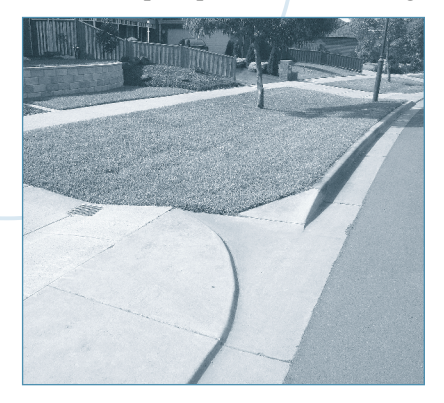
Grass swale in Lynbrook Estate, Melbourne. Curb 'funnels' direct road runoff into the swale system.

Site gradients – Vegetated swales are usually only suitable for slopes of 1-4% as steep slopes often lead to high