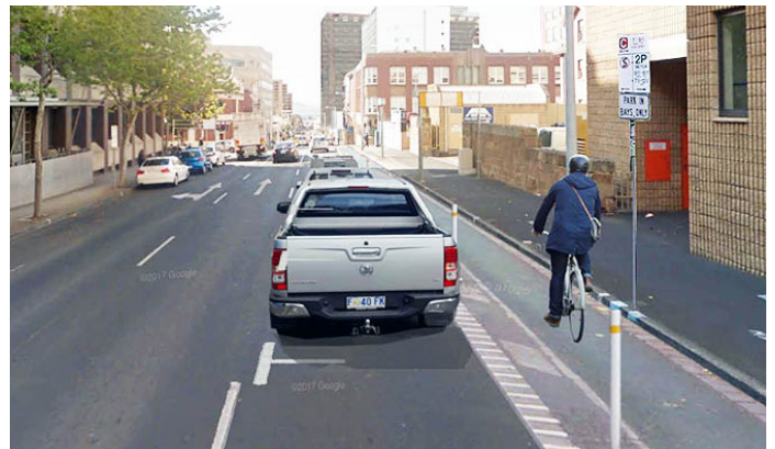
Artist's impression of a separated bicycle lane in Campbell Street.