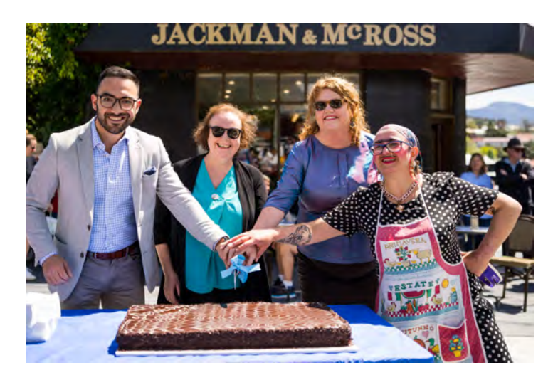
New Town Street Party