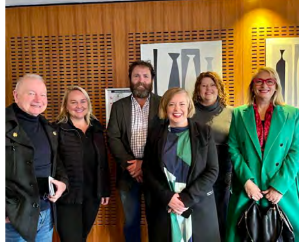
New Town Street Party