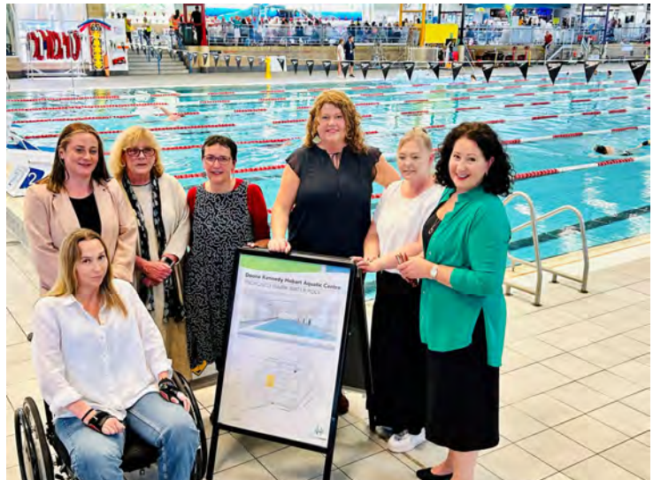
Doone Kennedy Hobart Aquatic Centre -Warmwater Pool project

Lord Mayor Reynolds attended 53 media events or