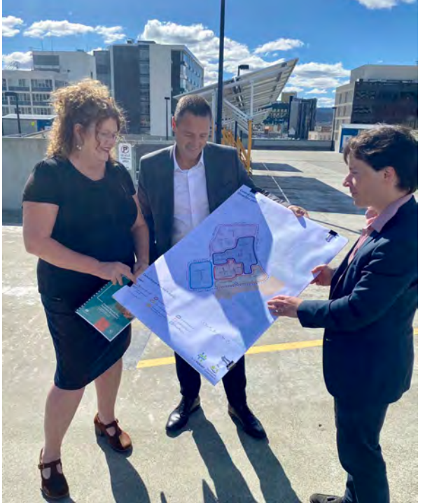
Central Hobart precinct plan