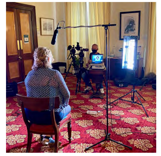
ABC TV Australia Story

While most media was local, she also appeared on national radio and TV about asylum seekers, short-stay accommodation and the William Crowther statue.