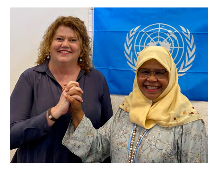
Lord Mayor Reynolds with Maimunah Mohd Sharif, former Mayor of Penang in Malaysia and now Head of UN Habitat