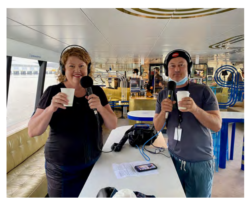
Media for launch of Council sponsored Saturday Ferry service