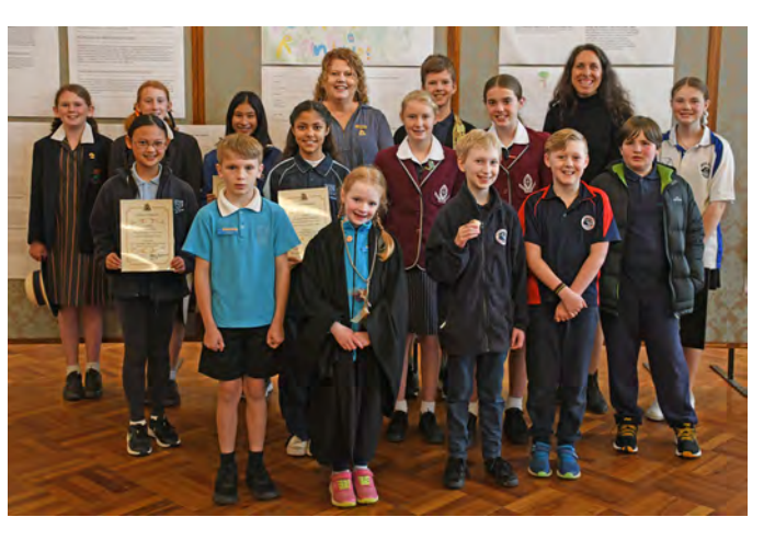
Children's Mayor submissions