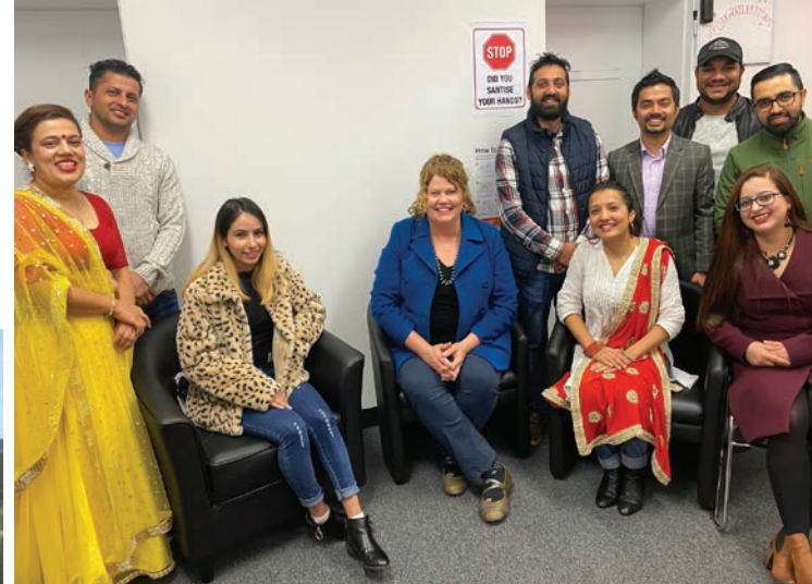
At the Nepali Society of Tasmania, Teej Photo Contest Winners (August 2020)

Packing 'survival packs' with St Vincent de Paul as part of Homelessness Week (August 2020)