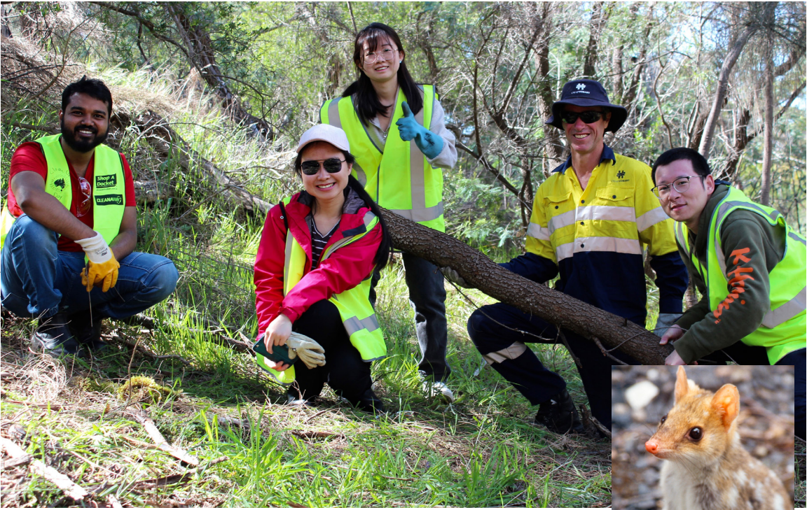
Bushcare volunteers have been protecting native habitat by removing damaging she-oaks from the Queens Domain grasslands. INSET: Eastern quoll are among the native inhabitants of the grasslands.

seedlings and a diverse array of native grasses and herbs – some of which are threatened species. The City of Hobart had spent the past year thinning the she-oaks before the Bushcare force moved in to help with removal. The many native animals that call bushland on the Queens Domain home – such as the eastern quoll, eastern barred bandicoot, tussock skink and masked owl – will also benefit from the project.