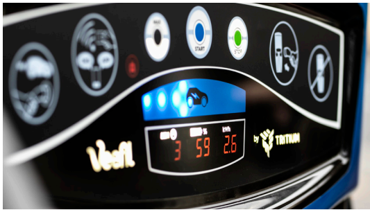
A fast-charge station is now at Dunn Place. The new fast-charge station is a fee-for-service facility that is operated via the EasyPark app. It can be used any time and is located within the Dunn Place carpark, accessed via Davey Street. The new station is in addition to two free AC trickle-charge bays at the Hobart Central carpark.

ELECTRIC vehicles can now power-up quickly and conveniently in the heart of Hobart city. A fast-charge station has been installed at the Dunn Place carpark, after the City of Hobart was successful in obtaining a $50,000 ChargeSmart Grant from the Tasmanian Government. The Dunn Place fast charger can be used at any time of day or night and is in a convenient location with room to expand as demand increases. It can fully charge a standard electric car battery in about half an hour, which is around a quarter of the time of the older-style trickle chargers. In the first month of use, the charger was used 130 times with an average charge time of 30 minutes.