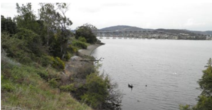
Photo: The weed infested rocky shoreline prior to weed removals, October 2012