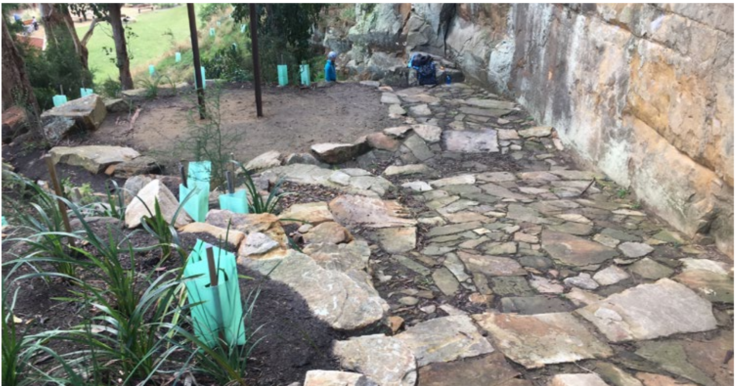
Photos: The plantings by the Cragcare group starting to flourish