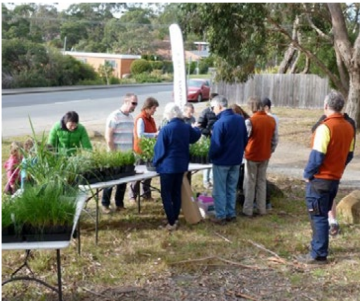
Photo: Mount Nelson Bushcare plant give-away

There's a few more native plants in the Hobart municipality thanks to Mount Nelson Bushcare. This group hosted one of several plant give-aways Bushcare will be organising for the remainder of this year. These events are a great opportunity for the community to learn about Bushcare and meet their local Bushcare champions. This year, Mount Nelson Bushcare dedicated their entire working bee to the plant give away which was hugely successful and made for a positive experience for everyone.