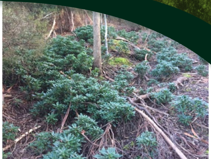
Photo: A patch of daphne laurel located on private property

Why map you may ask? Mapping allows groups and Council to target volunteer and contractor efforts, as well as gain an understanding of the spread of this novel weed.