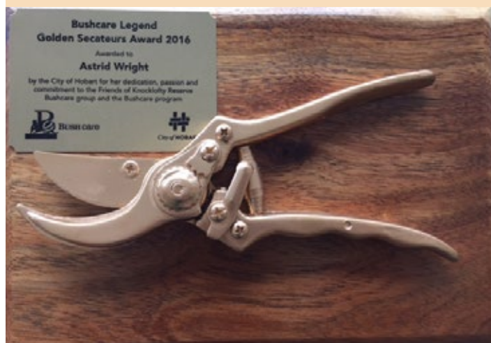
Photo: The 2016 Bushcare Golden Secateurs Award

If you would like to nominate a volunteer for this award please email a nomination to bushcare@hobartcity.com.au detailing why you think the volunteer is a bushcare legend. All nominations must be received by Monday 6 November 2017 at 9am.