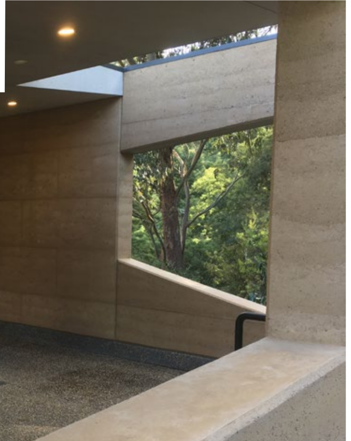
Photo: The new Ancanthe Park rammed earth toilet and bus shelter

Work has finished on the new rammed earth toilet and bus shelter at Ancanthe Park. These works are part of the Master Plan implementation with further master plan landscaping works to continue over the coming months.