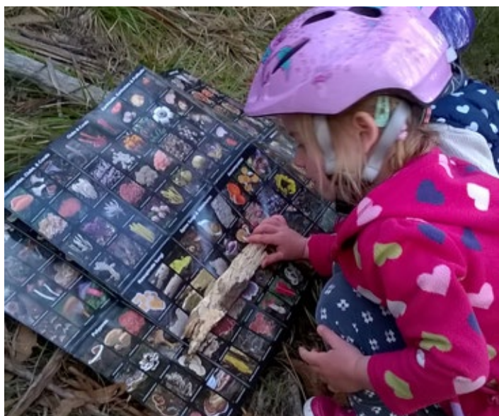
Photo: Ridgeway Bushcarers learning about fungi

Ridgeway Bushcare are back! After a short hiatus, the group held their first working bee of the year in June. With a new convener and several new residents in the area, the group welcomed no less than nine new volunteers to the group. After an introduction to the bushcare tools and cut and paint weeding method, the group set out to hunt for gorse seedlings. The junior bushcarers quickly got their 'eye in' and made very useful spotters! The hot chocolates and biscuits enjoyed for afternoon tea were well-earned. This group is very family-friendly, with activities provided for the kids when they tire of weeding.