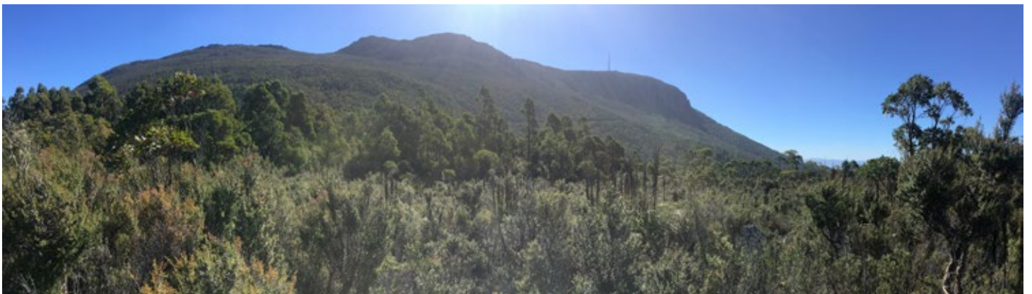
Photo: The Old exhibition garden track vista near the Springs lookout

Work is almost complete on the first stage of the Max's Infinity Loop project on the Queens Domain. The trail head car park below the big twin tanks has been upgraded and three softfall running surfaces are being trailed. The completed project will provide Hobart with one of the best running loops in Australia and offer a great incentive to anyone looking for a safe and enjoyable bushland environment to walk, run or ride.