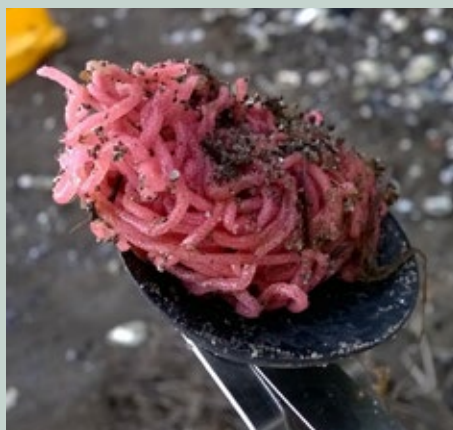
Photo: Sea hare egg string found by Friend's students at Cornelian Bay

Students made this strange discovery at their clean up event at Cornelian Bay, guesses at the identification of this 'noodley' mass included worms or algae, but it was later confirmed to be an egg string produced by a type of marine snail known as a sea hare (genus: Aplysia ).