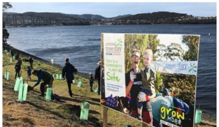
Photo: National Tree Day planting July 2017

This year for National Tree Day, the community was invited to participate in one of the last plantings for the project at a once weed infested rocky shoreline. 80 volunteers participated, planting 220 trees and shrubs. A big thank you to Mount Stuart Scouts, Lenah Valley Scouts and Ahmadiyya Muslim Community for bringing volunteers on the day.