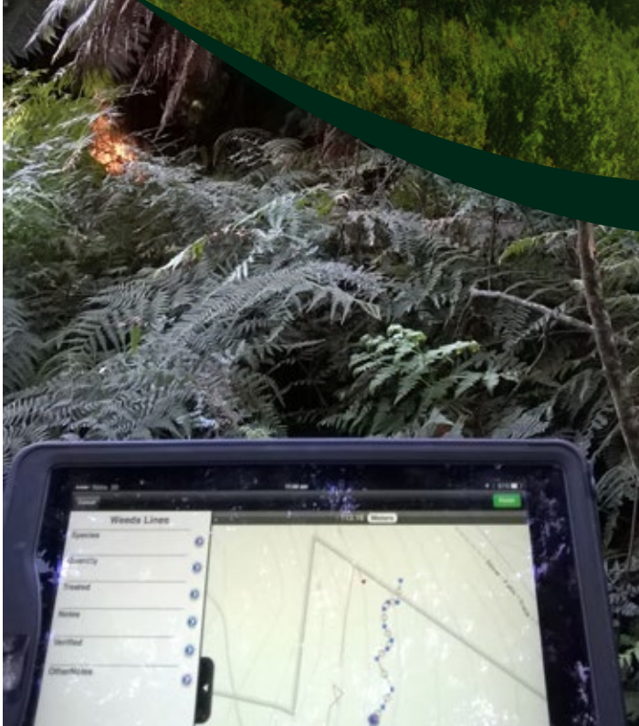
Photo: Mapping daphne laurel