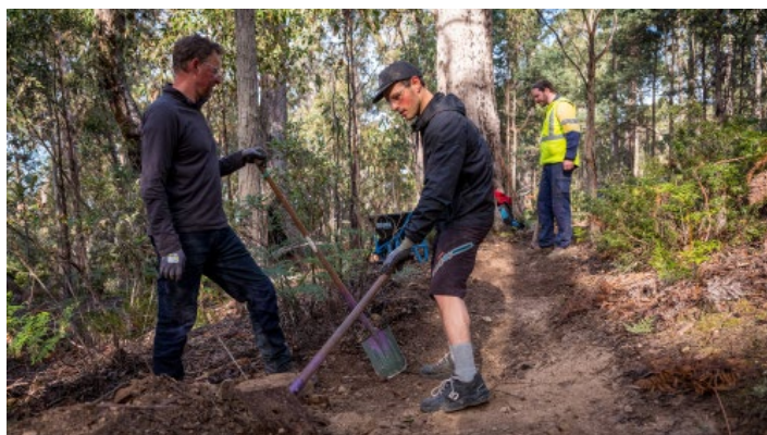
Photo: Trackcare volunteers maintaining the North-South Track

In July, ten Trackcare volunteers helped maintain the popular North South track on kunanyi / Mt Wellington. The aim of their working bee was to help improve the surface and drainage of the track north of Junction cabin to provide a better experience for track users. The work included some rock hardening and paving, as well as reinstating dips by building rollers. To find out more about the North-South track visit - www.greaterhobartrails.com.au/track/north-south-track