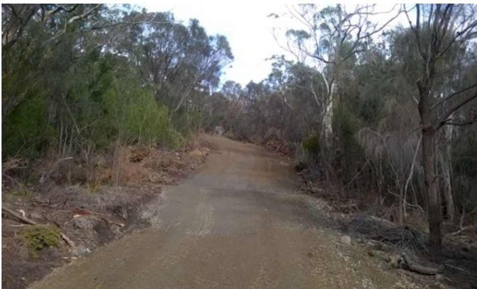
Photo: The upgraded Marlborough Fire Trail, Bicentennial Park