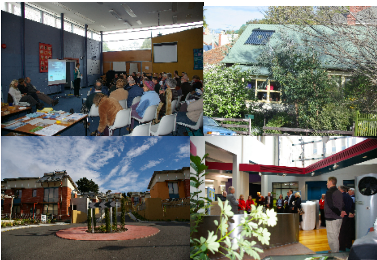
Images clockwise: Beat Winter Chills and Bills Question and Answer forum West Hobart 2008; Solar Hot Water Rebate recipient - evacuated tubes system; energy efficient development Windsor Court Argyle Street; Energy Display Hobart City Council Atrium June – Sept 2008.