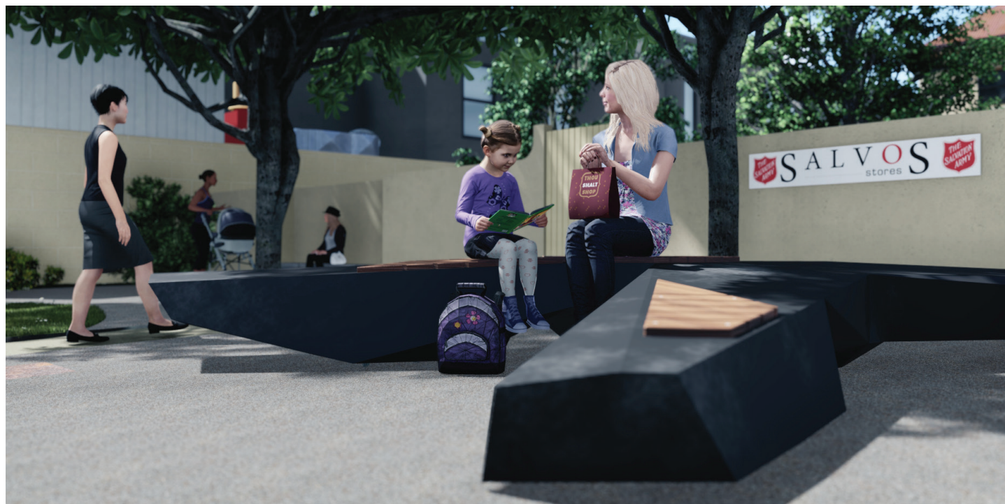
Artist's impression of streetscape upgrade including Hybrids – public artwork by Matt Drysdale.