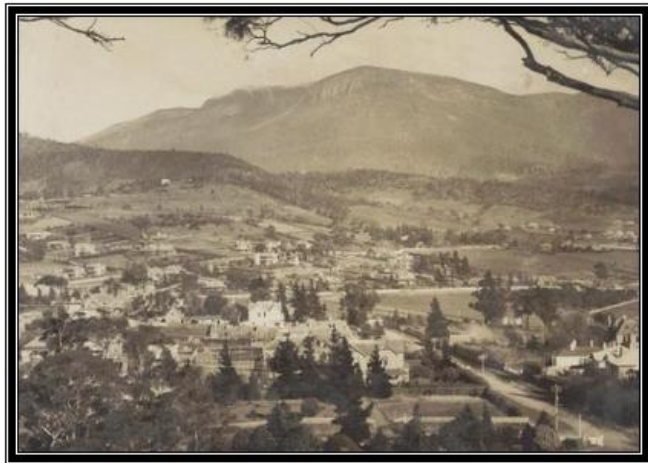
New Town from the Domain circa 1900

Shortly after World War I, subdivision of a significant amount of rural land and the grand estates occurred because of several interrelated factors. Among these factors was the further expansion and increasing efficiency of mass transport, which 'shrank' the distances between the city and New Town. Another factor contributing to the expansion of New Town was the Hobart City Council's recognition of the health benefits of living outside the city, and a consequent attempt to encourage suburbanisation. The most intense period of building in New Town occurred between 1918 until the mid 1920s, as many market gardens and orchards were changed to residential subdivisions (Pearce and Doyle, 1997: 27).