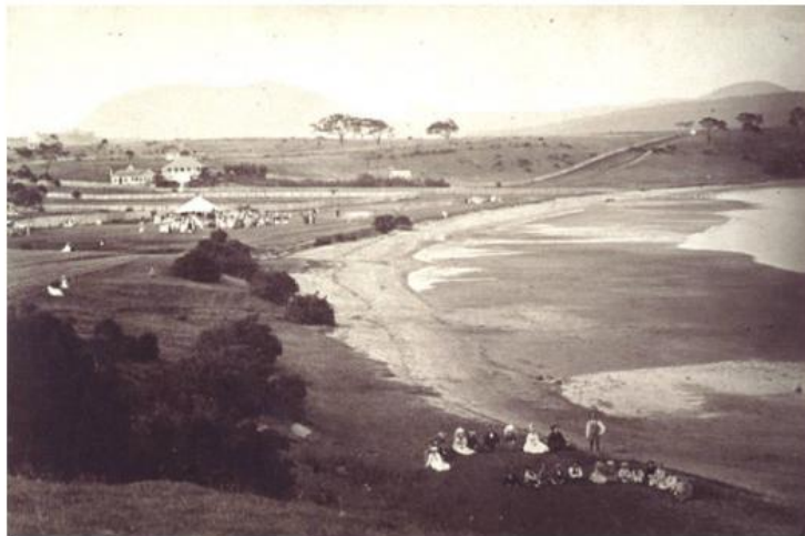
"Cornelian Bay, picnic"