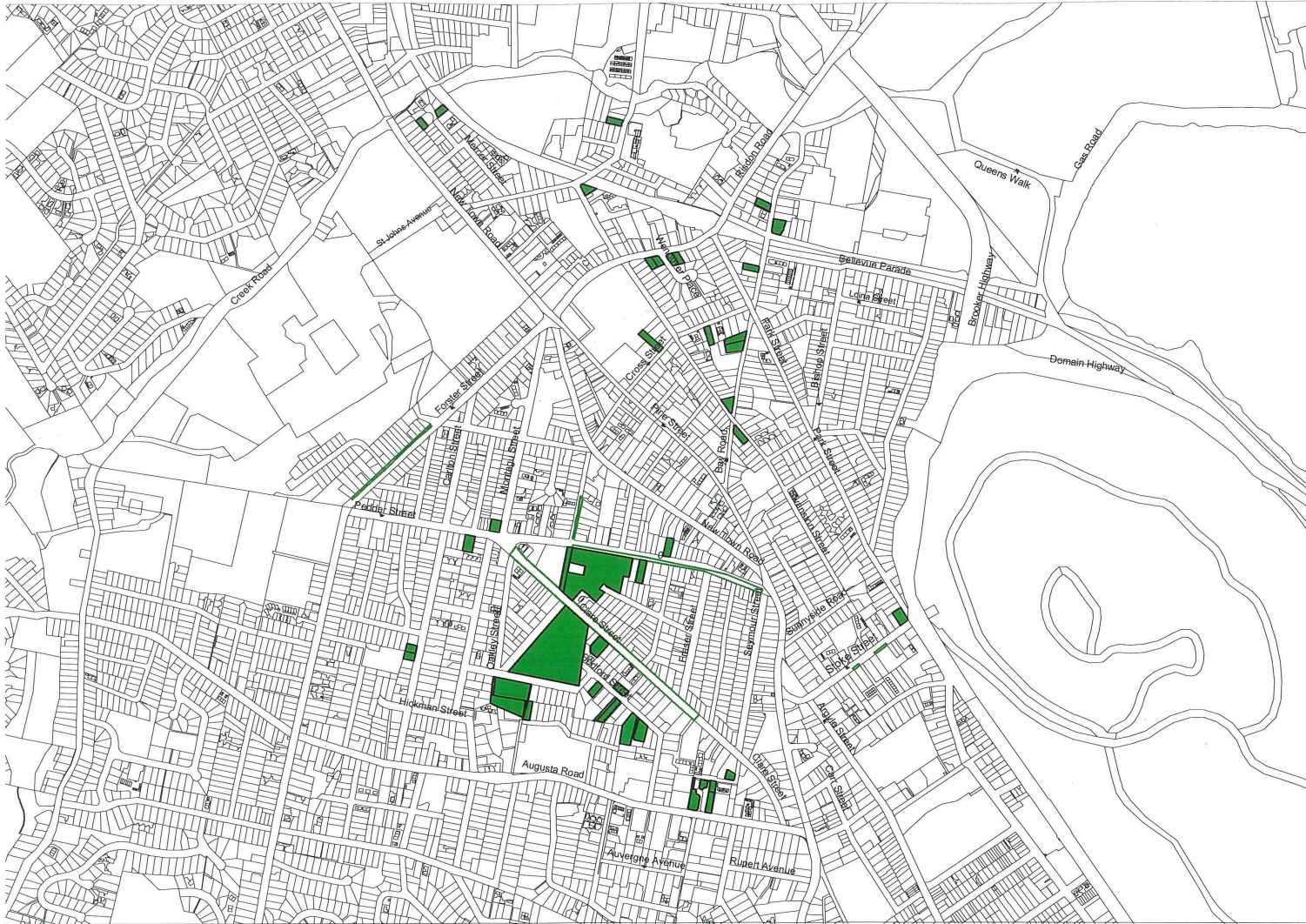
Figure 4: Map of Identified significant gardens as identified by Douglas (1999)