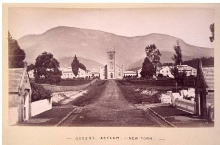
“The Queens Asylum” St Johns complex, circa 1875