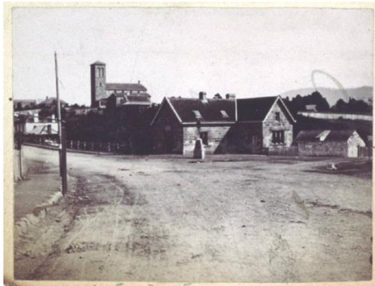
Maypole Hotel, Circa 1888

New Town did not experience any large scale concentrations of industry on the same scale as the northern suburbs of Moonah, Lutana and Glenorchy.