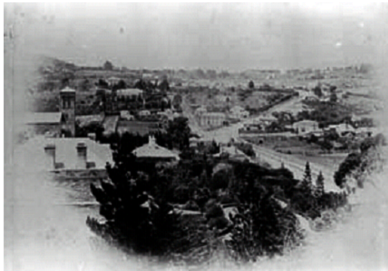
New Town circa 1885

Pearce and Doyle (1997: 18) state that New Town remained a 'place of wealth' well into the twentieth century.