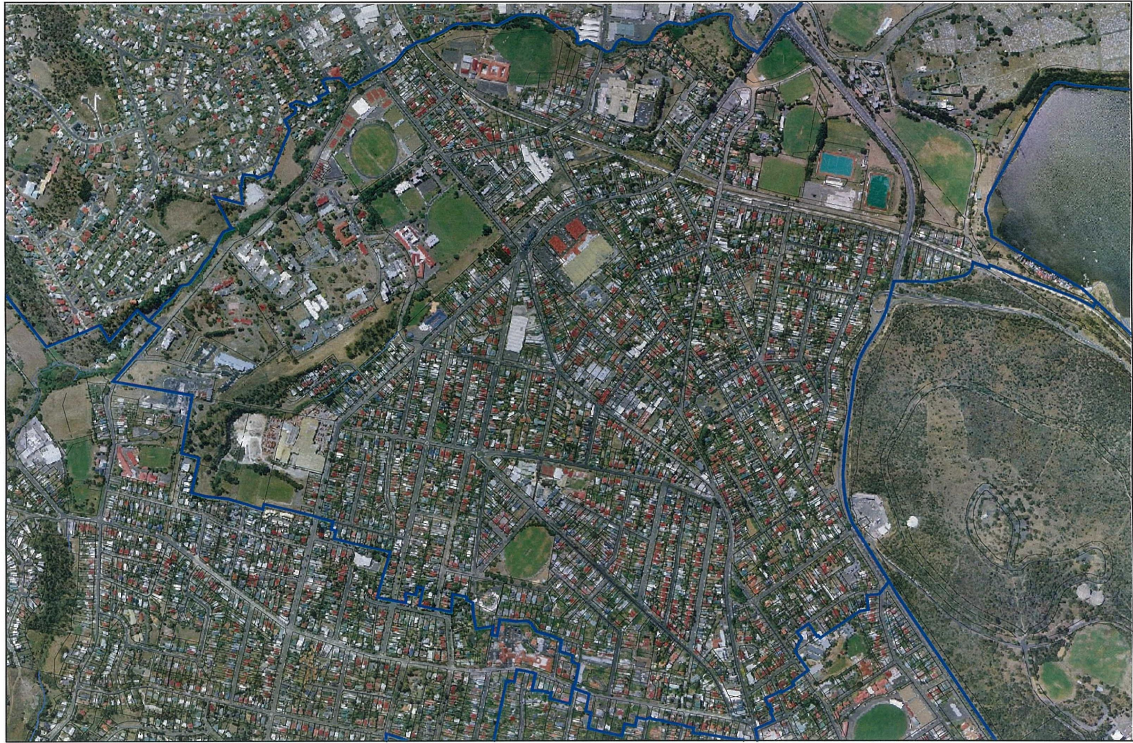
Figure 1: New Town Study Area indicated within blue line