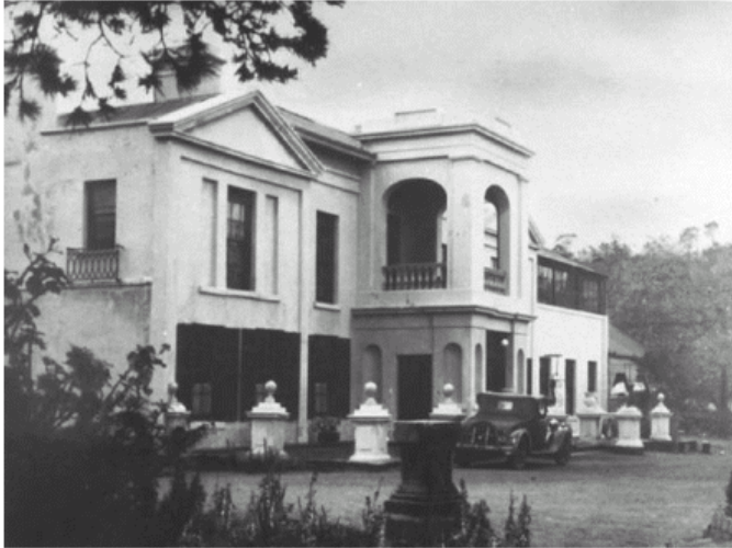
“Boa Vista” Date: ca. 1940