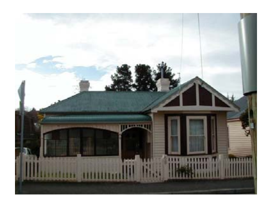
Description: A single storey weatherboard Federation style cottage. The cottage is asymmetrical in plan, and is one of a group of similar residences located on the northern side of Queen Street.