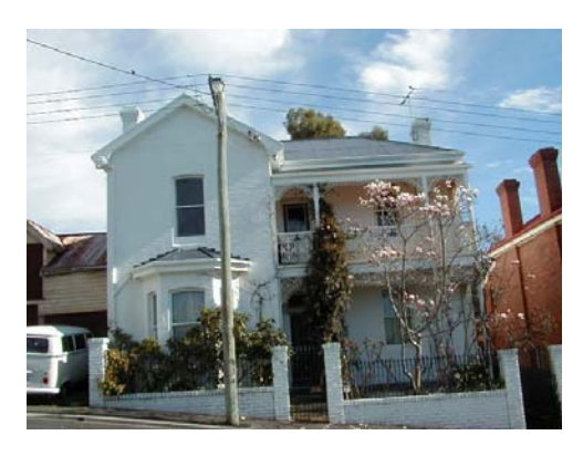
Description: A two storey painted brick Federation period house, with verandah/balcony decorated with iron lace. It is one of two similar houses that make a valuable contribution to the streetscape of the area.