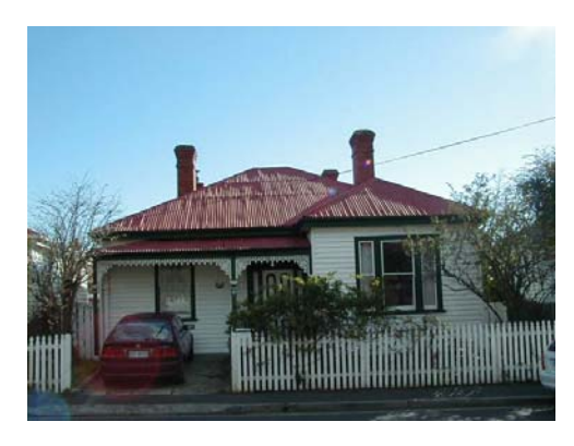
Description: A single storey late Victorian weatherboard cottage of asymmetrical plan. It is a valuable element within the historic streetscape of King Street.