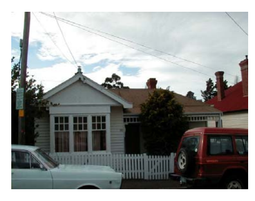
Description: A single storey weatherboard Federation cottage that is asymmetrical in plan. It is one of a group of cottages of similar style and form that are located on the northern side of Queen Street.