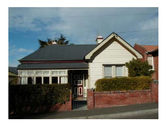
Description: A single storey Federation cottage of weatherboard construction. It is located on the southern side of King Street, and is one of a group of elegant timber cottages lining King Street.