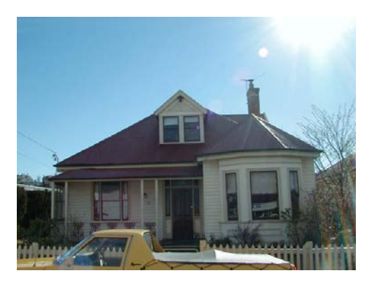
Description: A single storey weatherboard late Victorian cottage. It has a hipped roof clad with corrugated iron and a single brick chimney. The façade is asymmetrical: there is a bay window, decorated verandah and central door.