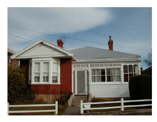
Description: A single storey brick Federation period house that is asymmetrical in plan. It is one of two similar cottages located on the southern side of Queen Street.