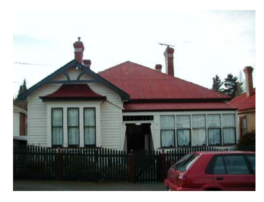
Description: A single storey weatherboard Federation cottage. It is asymmetrical in plan, and is one of a group of similar style cottages that are located on the northern side of Queen Street.