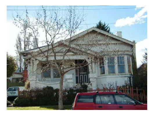
CRITERIA FOR ENTRY IN REGISTER