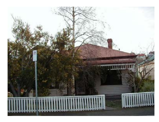
Description: A single storey weatherboard late Victorian cottage that is asymmetrical in plan. It is one of a group of similar cottages located on the northern side of Queen Street.