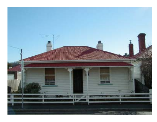
Description: A single storey weatherboard Federation cottage that is symmetrical in plan. It is located on the northern side of King Street, and is one of a number of historic cottages that are located along both sides of King Street.