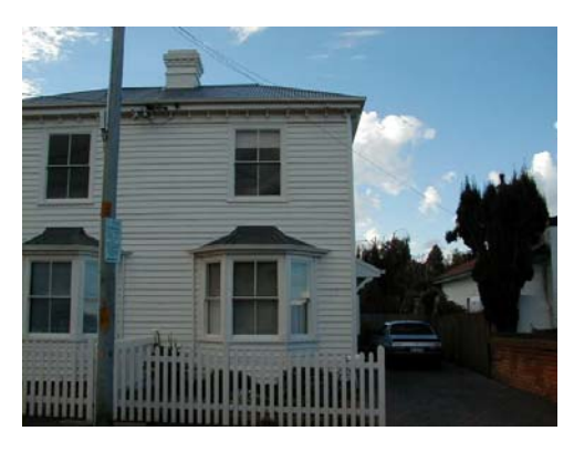
Description: A two storey weatherboard Federation conjoined cottage. It is located on the northern side of King Street and is a prominent element in the predominantly late C19th early C20th streetscape.