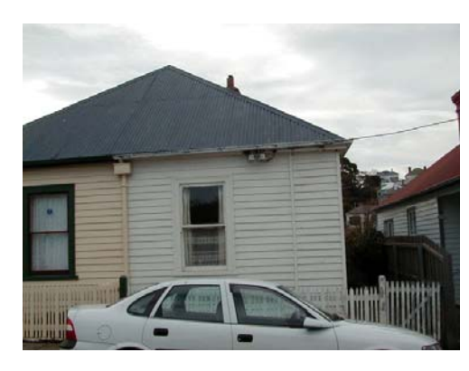
Description: A single storey weatherboard late Victorian conjoined cottage. It has a hipped roof clad with corrugated iron, and a single brick chimney. The porch area has been completely built in.