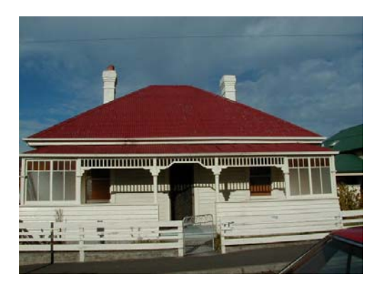
Description: A single storey Federation cottage of weatherboard construction. It is one of two similar cottages, and is located on the southern side of King Street at the corner with Russell Crescent.