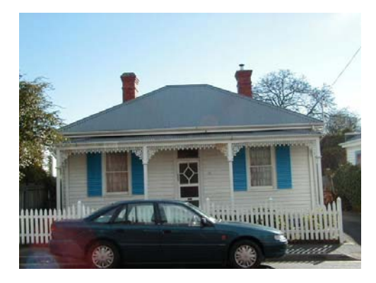
Description: A single storey late Victorian cottage of weatherboard construction. It has an asymmetrical façade, sheltered by a verandah decorated with iron lace. There is a modern front door and louvered shutters to both windows.