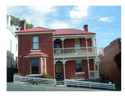
Description: A two storey brick Federation house with a ornate timber verandah/balcony to both levels. It is one of two similar houses, and makes an important contribution to the historic streetscape of the area.