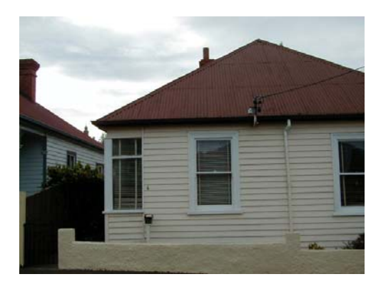
Description: A single storey weatherboard cottage with hipped roof clad with corrugated iron and a single brick chimney. The original porch area has been completely built in.