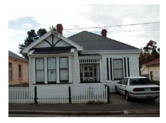
Description: A single storey weatherboard Federation style cottage. The cottage is asymmetrical in plan, and is one of a group of similar residences located on the northern side of Queen Street.