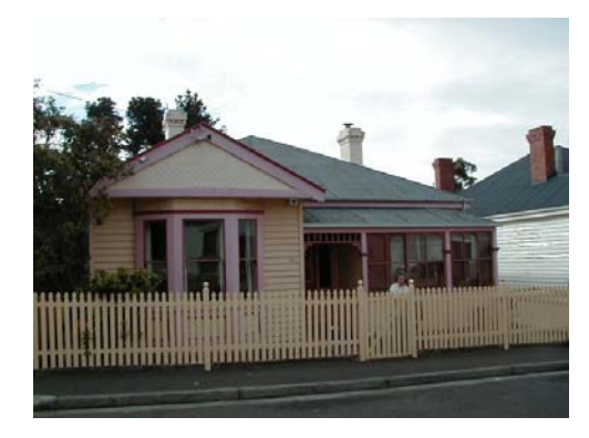
Description: A single storey weatherboard Federation style cottage. The cottage is asymmetrical in plan, and is one of a group of similar residences located on the northern side of Queen Street.