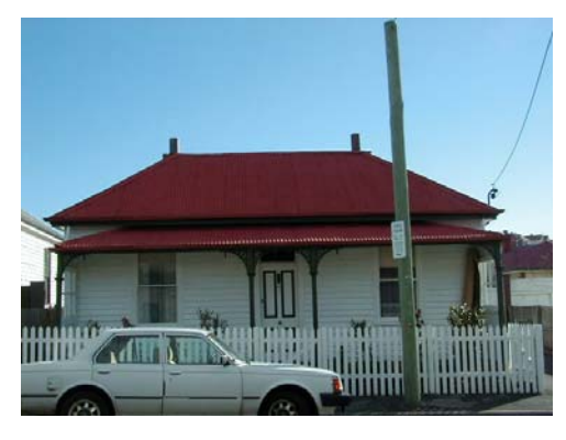
Description: A single storey weatherboard late Victorian cottage of symmetrical plan. It is located on the northern side of King Street, and is one of a group of similar cottages.