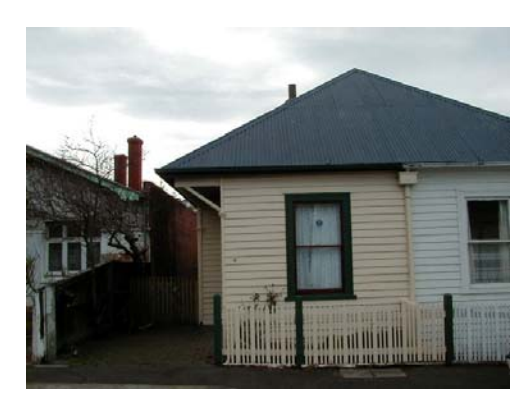
Description: A single storey conjoined weatherboard cottage of late Victorian styling. It has a hipped roof clad with corrugated iron, a single brick chimney, and a porch area which has been modified.