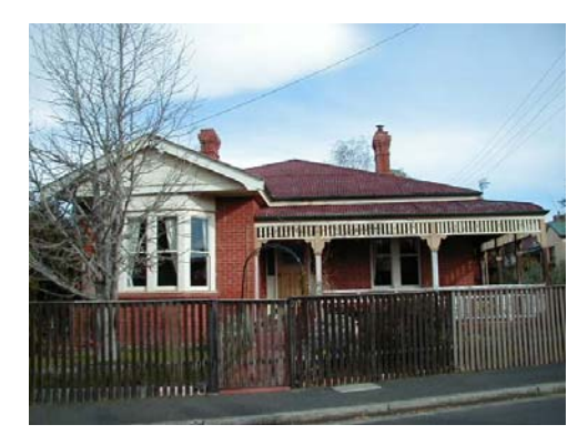
Description: A single storey brick Federation period house that is asymmetrical in plan. It is one of two similar cottages located on the southern side of Queen Street.