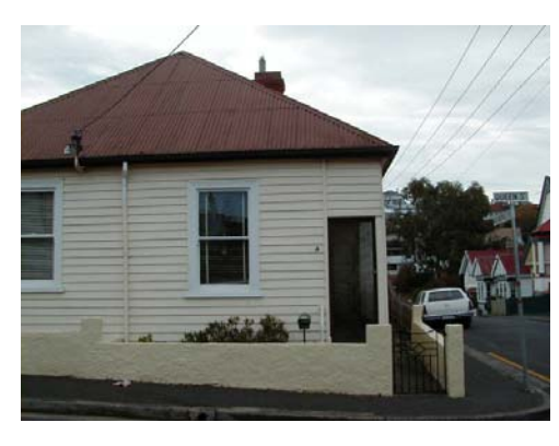
Description: A single storey conjoined weatherboard cottage in the late Victorian style. It has a hipped roof clad with corrugated iron and a single brick chimney. The original porch area has been built-in.