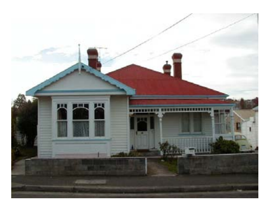
Description: A single storey weatherboard Federation cottage. It has an asymmetrical plan, and is one of a group of similar style cottages located on the northern side of Queen Street.