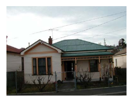
Description: A single storey weatherboard late Victorian cottage that is asymmetrical in plan. It is one of a group of similar cottages located on the northern side of Queen Street.