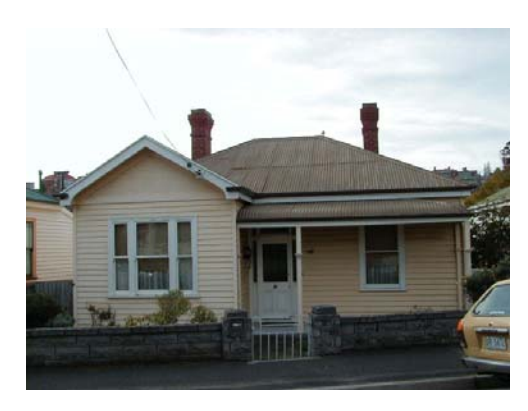
Description: A single storey weatherboard late Victorian cottage that is asymmetrical in plan. It is one of a group of similar cottages located on the northern side of Queen Street.