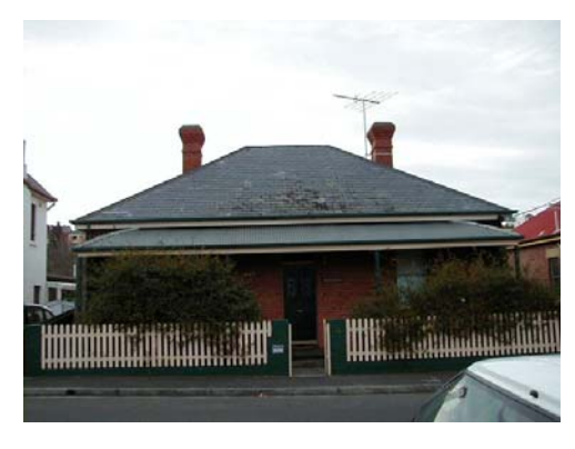
Description: A single storey brick late Victorian cottage. It has a hipped roof of slate and two brick chimneys. There is a verandah which shelters the symmetrical façade.