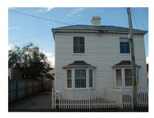
Description: A two storey Federation conjoined cottage of weatherboard construction. It is located on the northern side of King Street and is a prominent element within the urban streetscape.