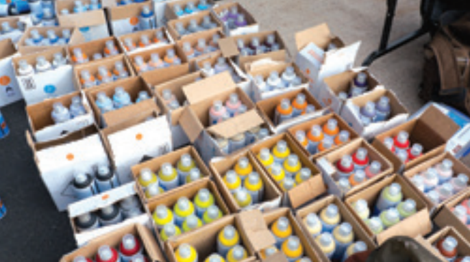
At the festival site