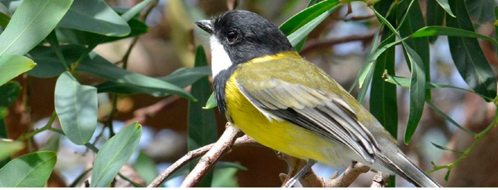
Bushland birds like the golden whistler are extremely sensitive to the presence of dogs.