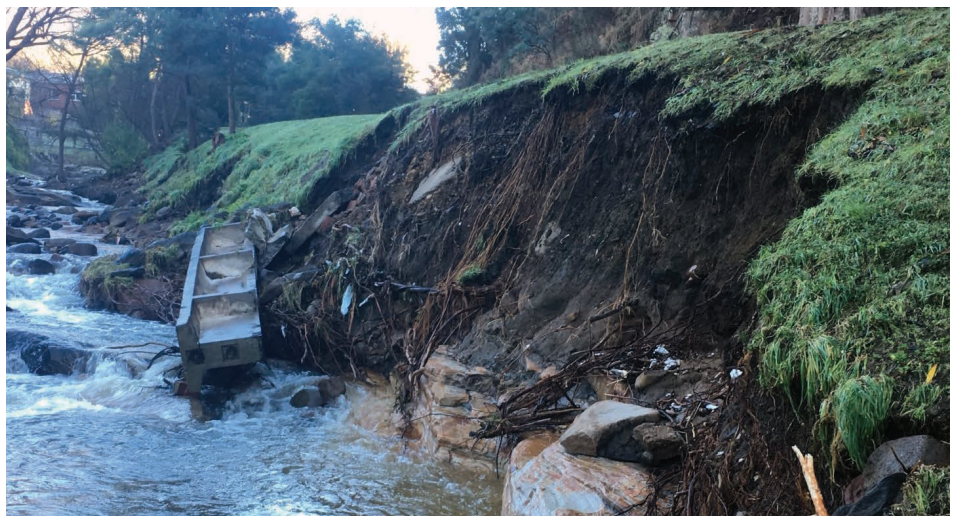
Hobart Rivulet was hit particularly hard by the deluge of water.

Huge boulders that a decade earlier had been carefully levered into place to form the iconic Clapper Bridge on the North-