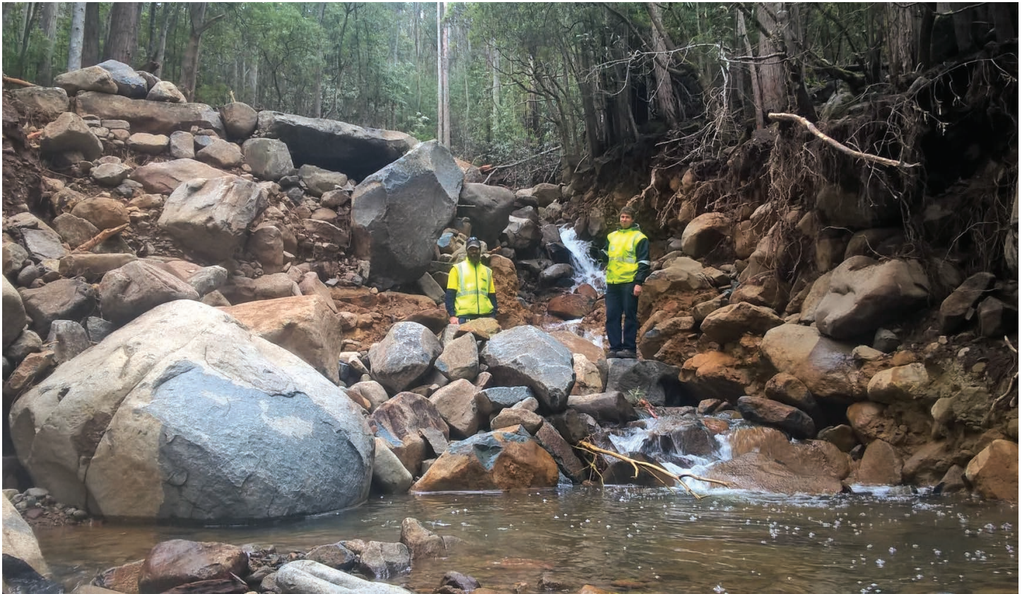
The huge rock boulders that formed the Clapper Bridge on the North-South Track were washed away by the floods.

crossing by replacing the old stone clapper bridge with an equally beautiful rivulet crossing. The magical boulder field tracks in Lost World on kunanyi/Mount Wellington suffered heavy damage and had to be repaired, the stone steps that link Wellesley Park in South Hobart needed rebuilding and repairs were carried out on parts of the Glover Track in Knocklofty Reserve.