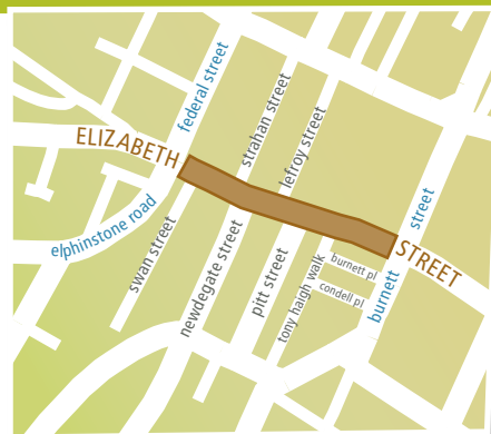
Elizabeth Street Mall and Hobart Waterfront this way